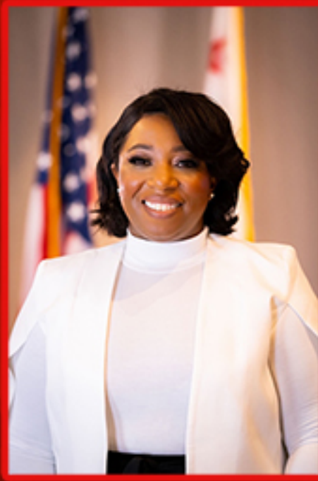
MAYOR LETITIA CLARK

OCAC-CA WEAR RED DAY/SOCIAL MEDIA PHOTO POSTS PAST AND PRESENT